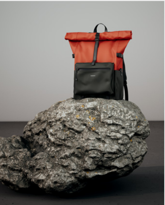
STREAM SERIES / Ruben Multi Orange/Dark Green Backpack