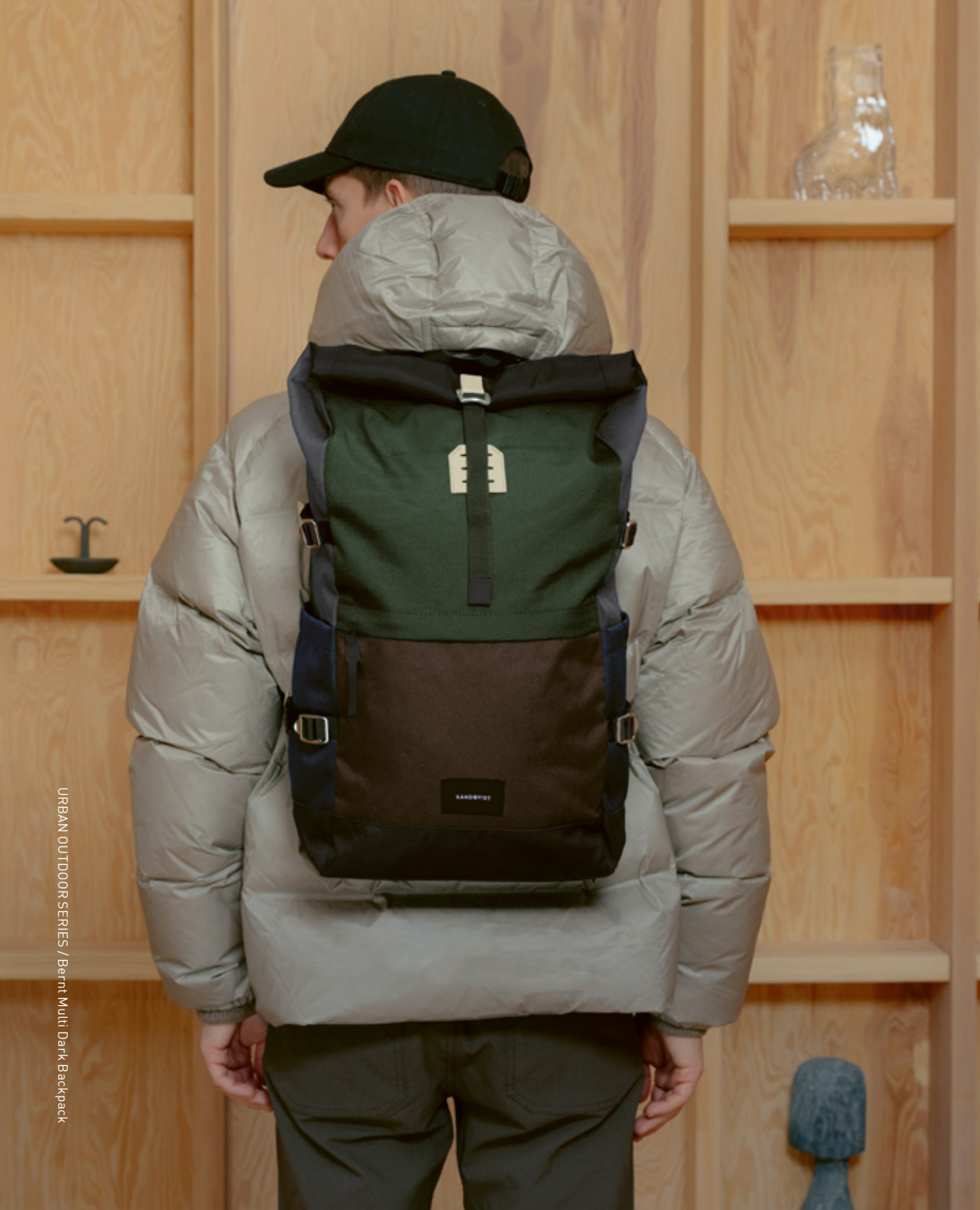
URBAN OUTDOOR SERIES / Bernt Multi Dark Backpack