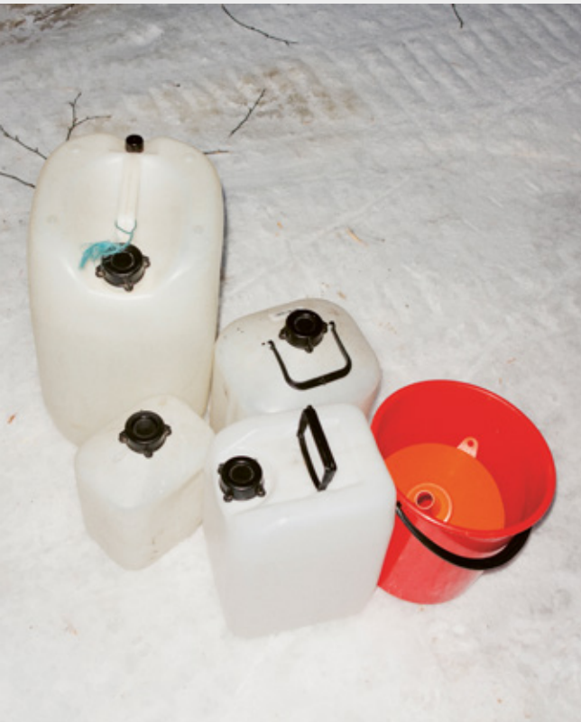
Staying hydrated in Härjedalen / 2012