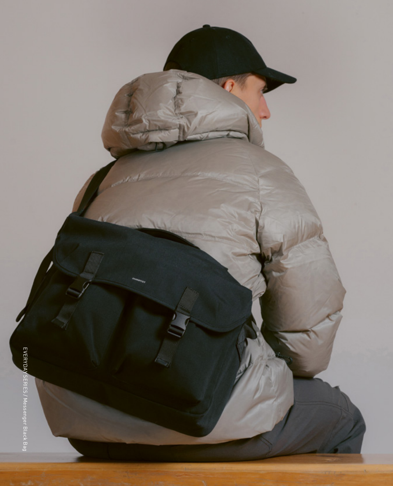
EVERYDAY SERIES / Messenger Black Bag