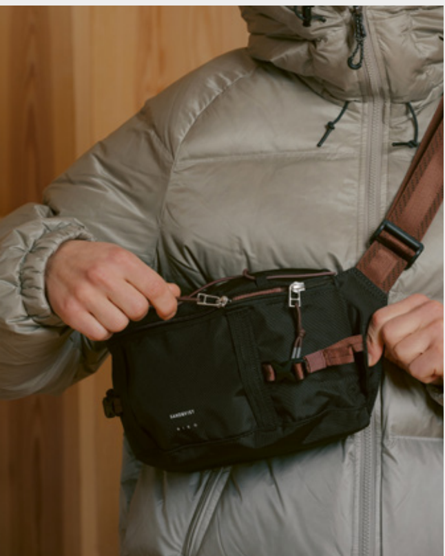
HIKE SERIES / All Terrain Crossbody Black Bag