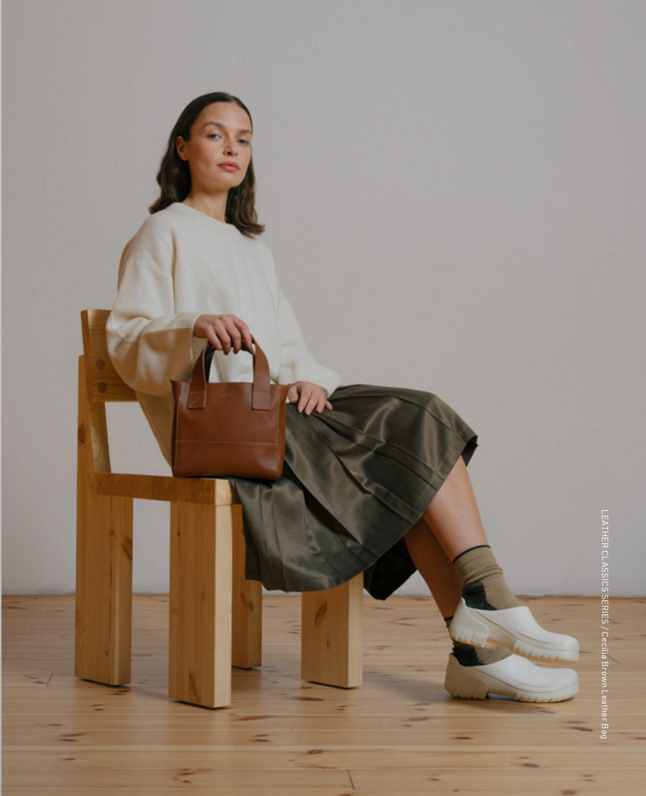
LEATHER CLASSICS SERIES / Cecilia Brown Leather Bag