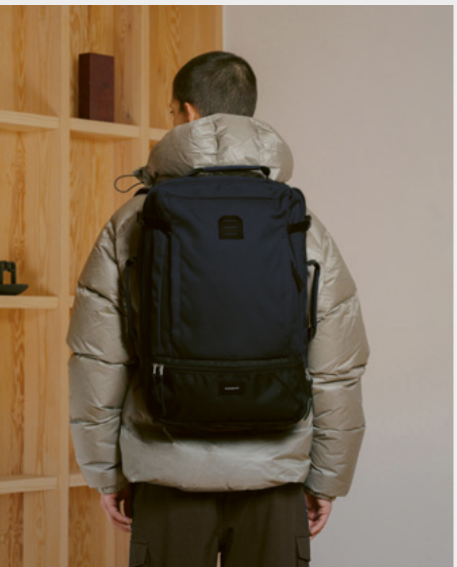
URBAN OUTDOOR SERIES / Otis Multi Navy Backpack