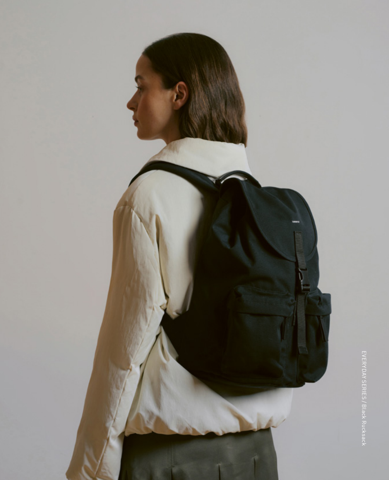
EVERYDAY SERIES / Black Rucksack