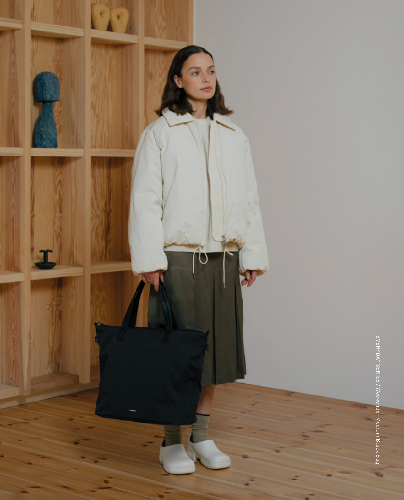
EVERYDAY SERIES / Weekender Medium Black Bag