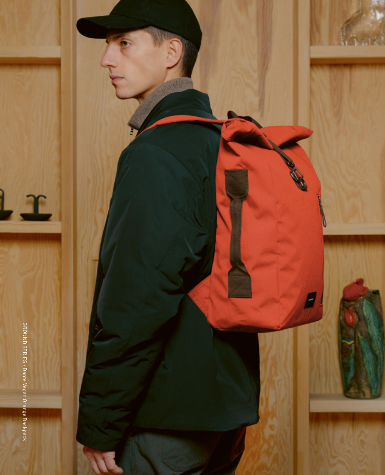
GROUND SERIES / Dante Vegan Orange Backpack