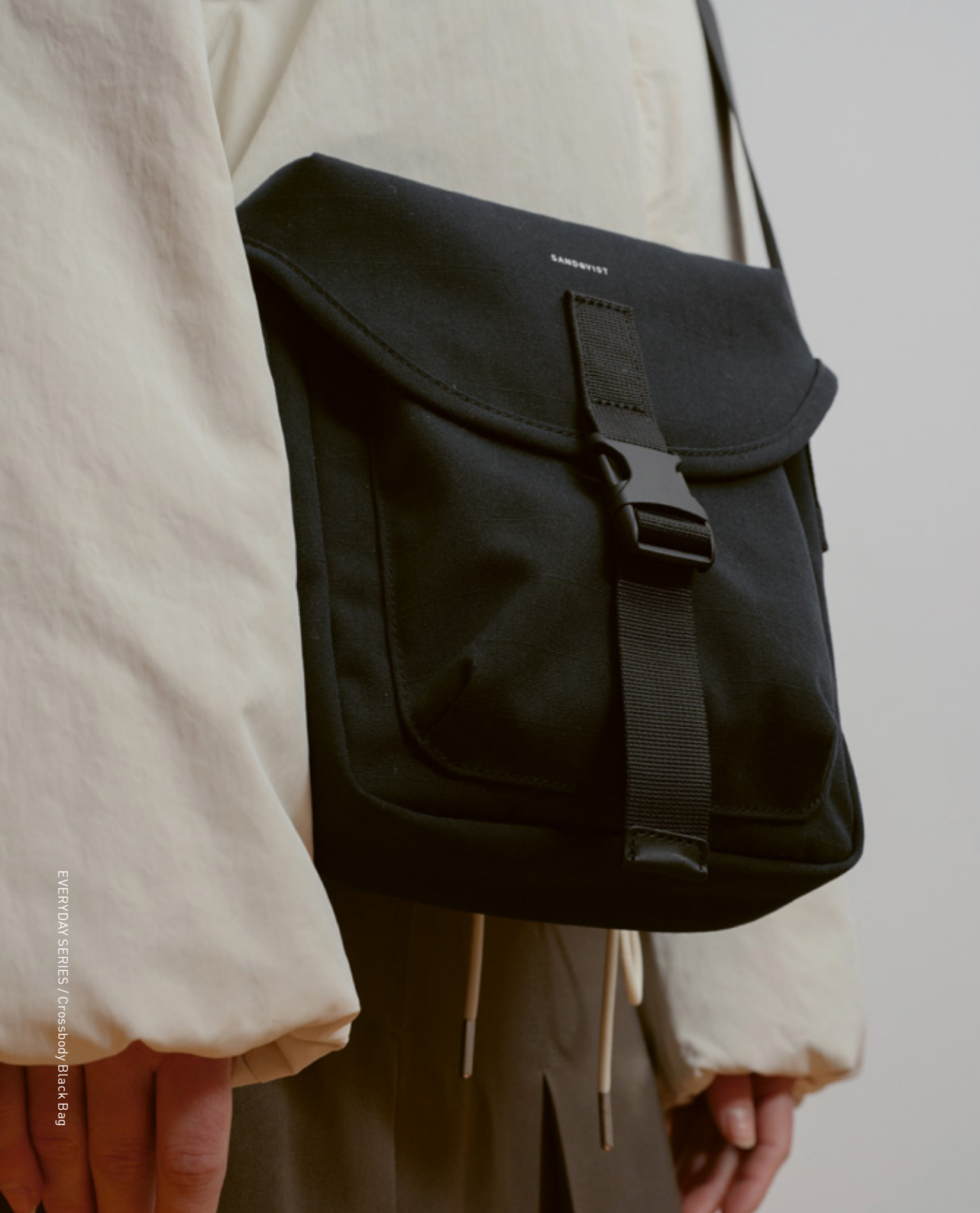
EVERYDAY SERIES / Crossbody Black Bag